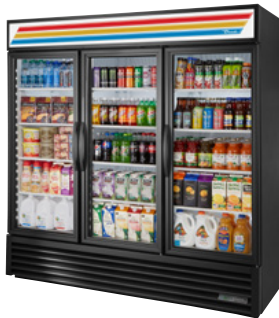
Standard Black Exterior